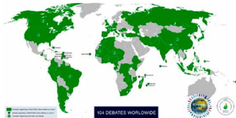
Countries hosting a World Wide Views Climate Energy debate on June 6 2015